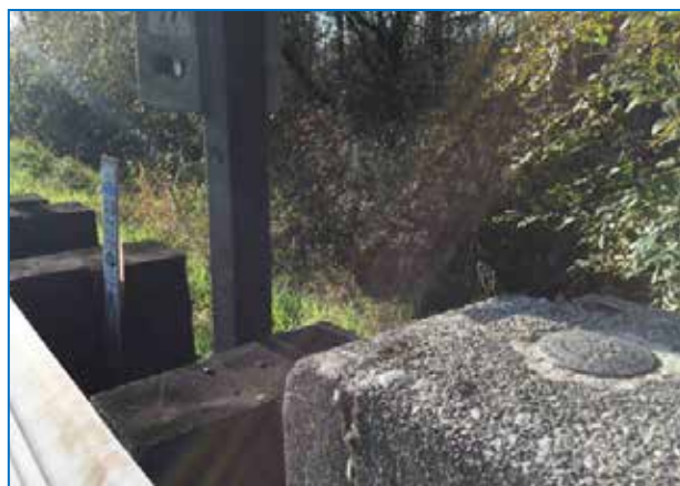
Witness post to the left of the Geodetic Marker