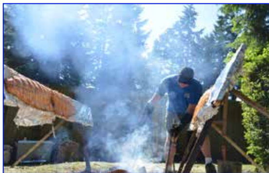
2019 Salmon Bake