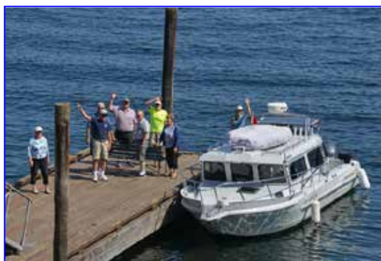
2019 Maple Bay, BC Slider